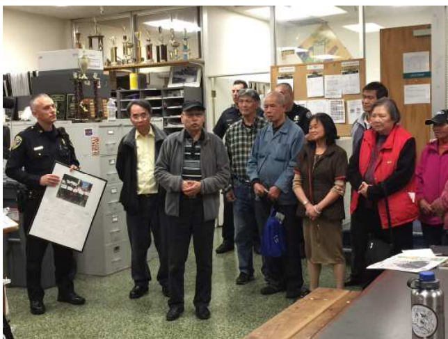
Members of Chinatown's "Friends of Tenants" came to Central Station on March 18 th to thank Central Station Officers for their service to the community.