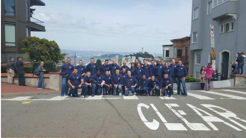
Members of the 252nd Class at Hyde and Lombard.