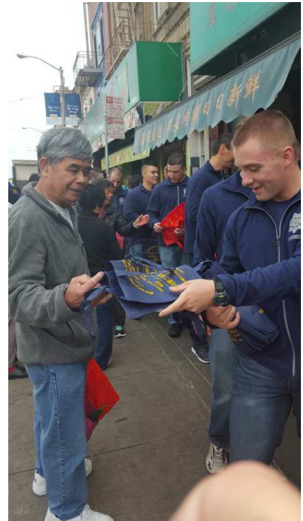
Giving out blessing scam awareness bags.