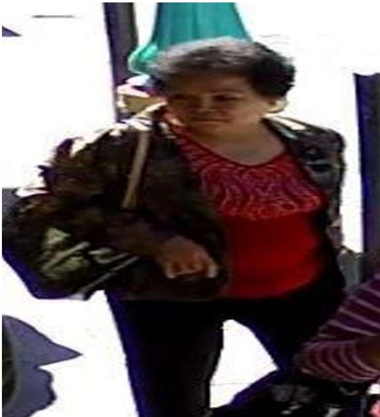
"Blessing Scam Suspect"