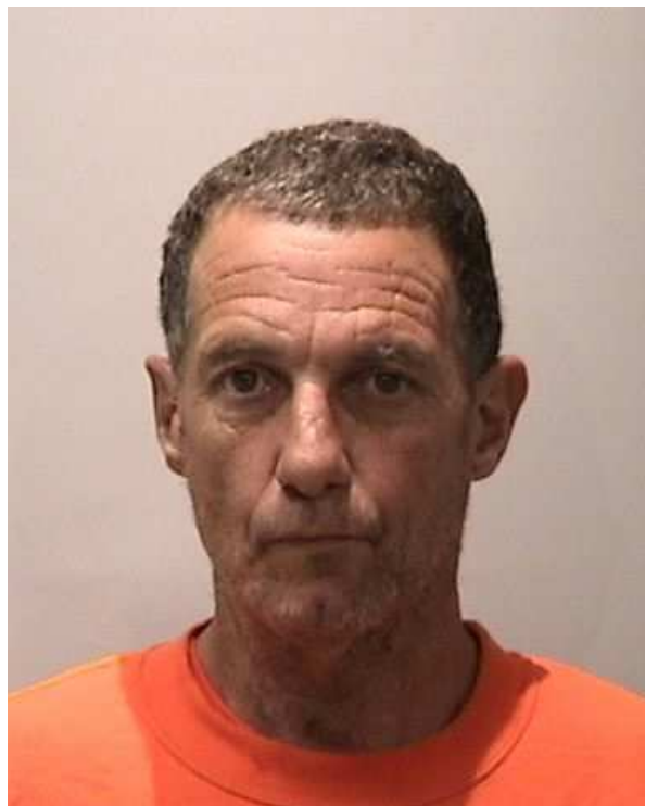
Devito Arson Suspect