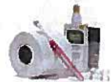
Personal Hygiene + Sanitation Items