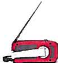
Radio (battery operated or hand crank)