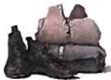
Warm Clothes and Sturdy Shoes